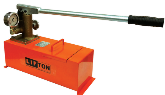
MTP-L1, L3, L5, L7