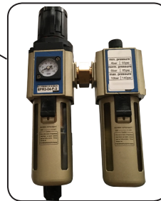
Filter & Lubricator